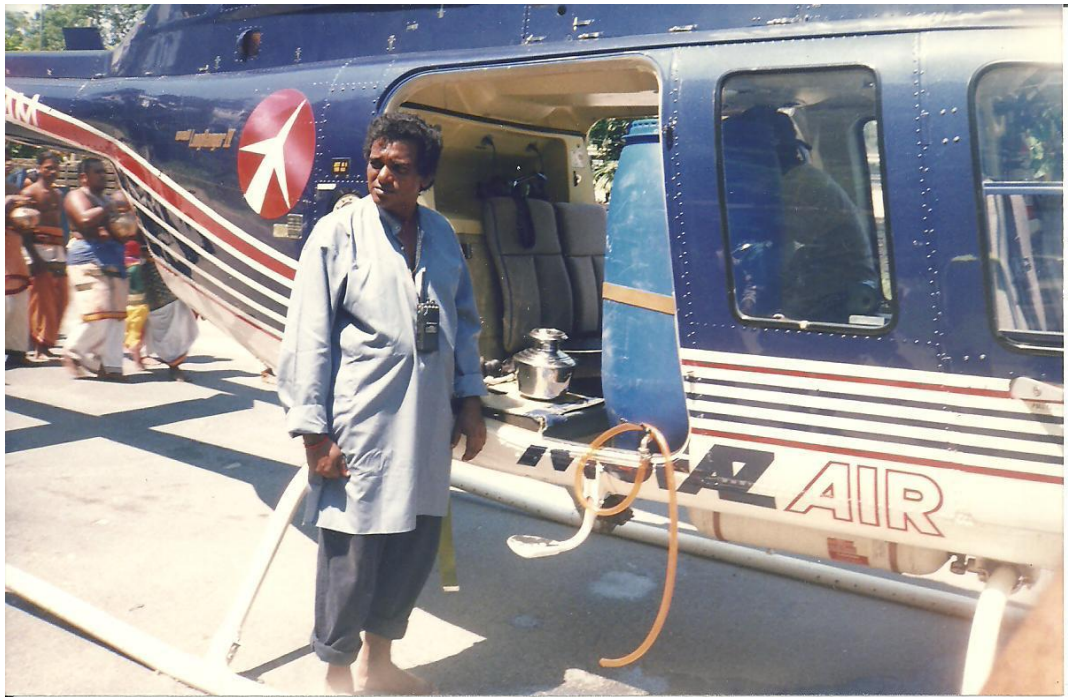
On the concluding session Holy Water brought from Indian Rivers was sprinkled over thousands of devotees from Helicopter