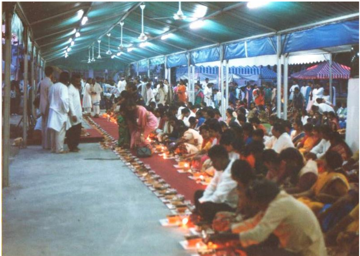
Performance of Agnihotra by 108 persons